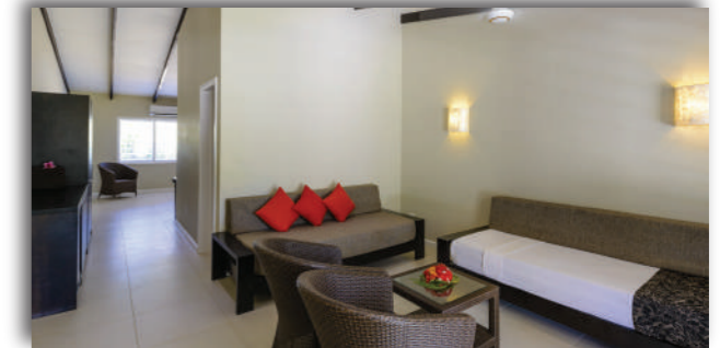
One Bedroom Garden Terrace