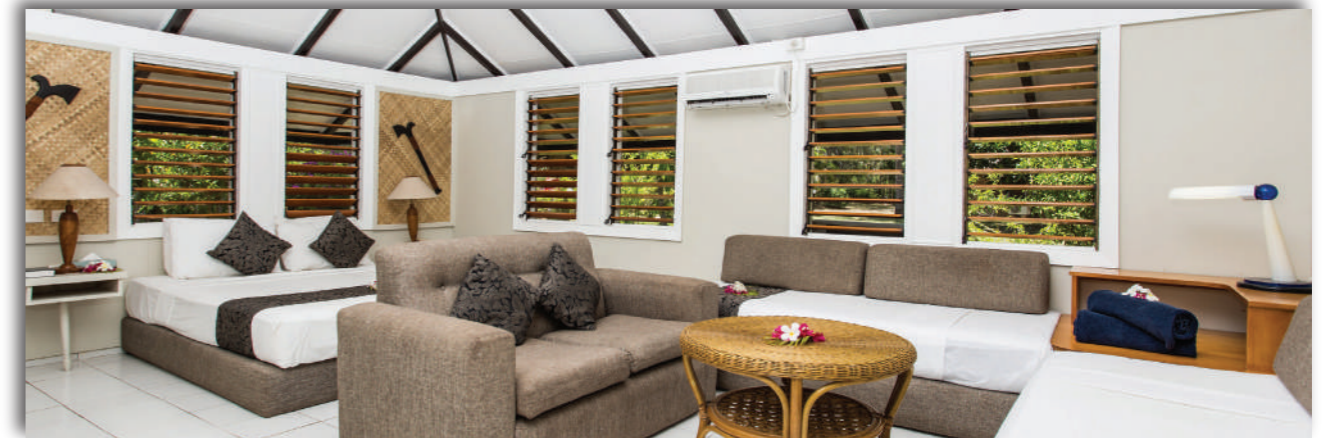
Studio Garden Bure