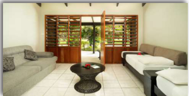
Garden Terrace Room