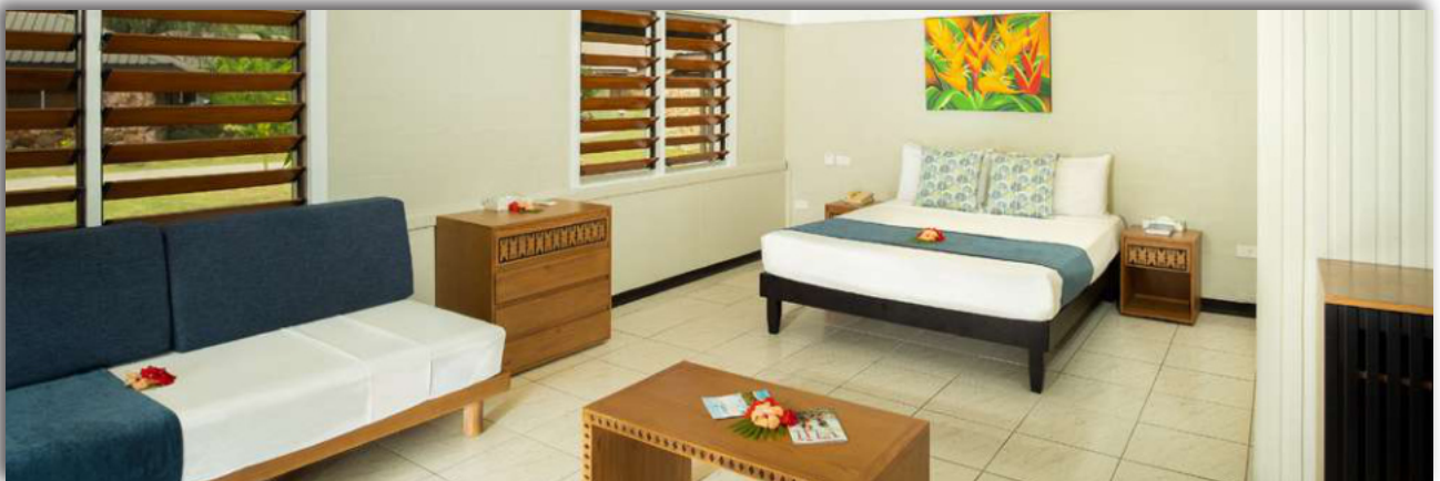
Studio Garden Bure