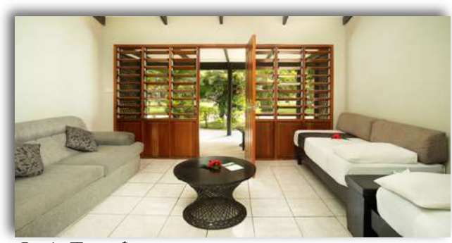
Garden Terrace Room